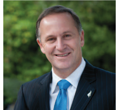
Rt Hon John Key