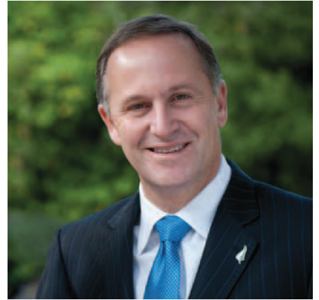
Rt Hon John Key