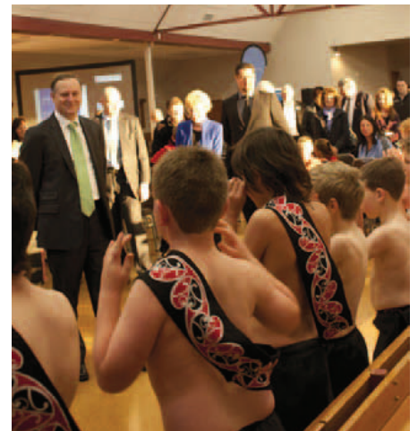
Announcing the $1.1 million grant for Kaiapoi's Aquatic Centre