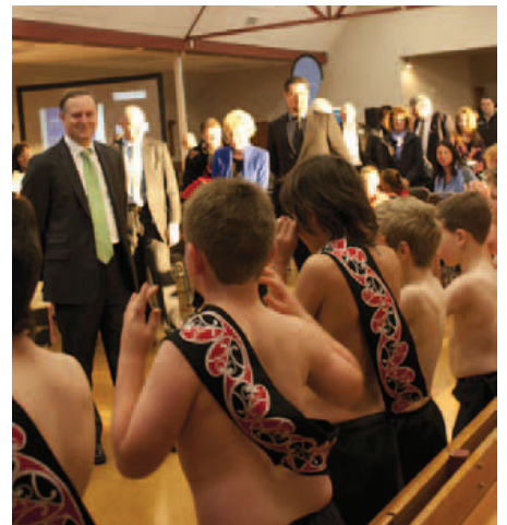
Announcing the $1.1 million grant for Kaiapoi's Aquatic Centre