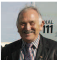
Tane Norton (MNZM)